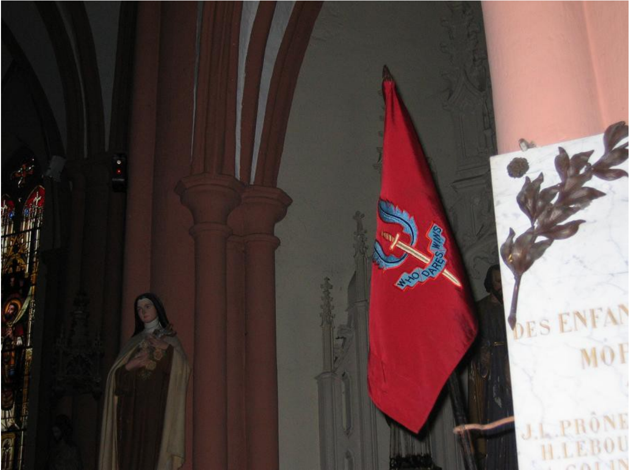
Eglise de Moussey. Le fanion du 2ème SAS accroché là depuis le 18 août 1945