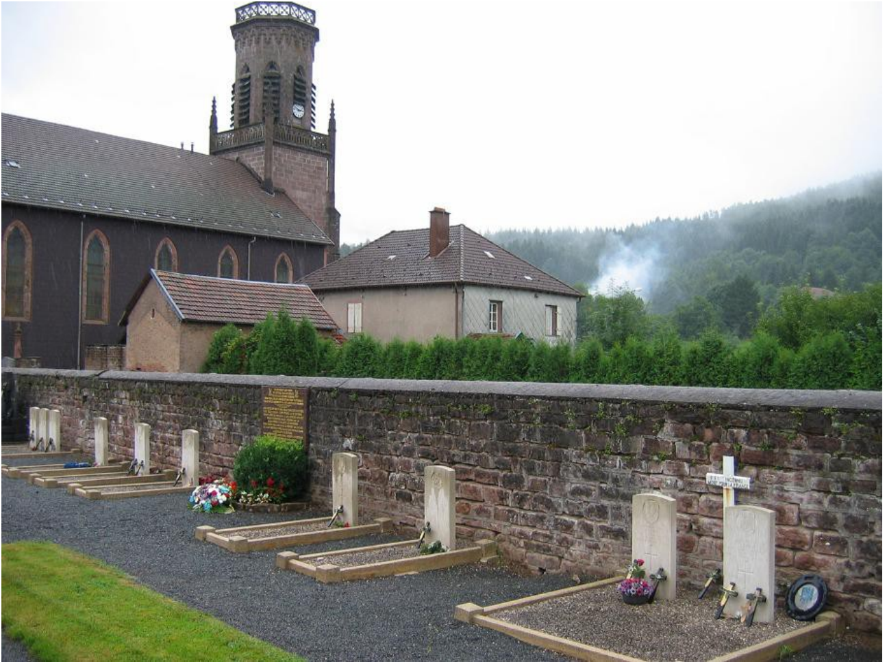
Cimetière de Moussey. Les « Tombes des Anglais »